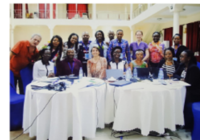
Sharing experiences and lessons learnt workshop on Integrating nutrition in the response to Ebola virus disease outbreak held in Goma DR Congo from 13th to 16th May 2019; supported by the GNC helpdesk and RRT.

The RRT members can provide dedicated surge capacity, both in-country and remotely, to any country office and are deployable within 72 hours (depending on visa procedures). Emergency in-country support is usually provided for up to 8 weeks, with a possible extension for a period of up to 12 weeks. It is the responsibility of the country office to organise for and recruit a longer-term NCC or IMO, if needed.